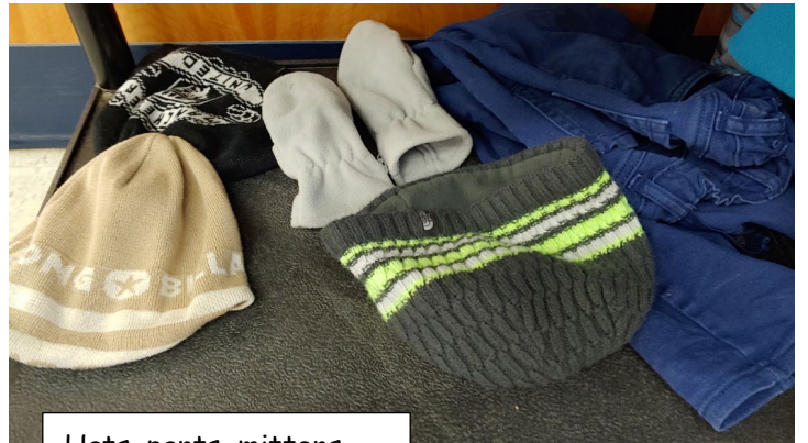
Hats, pants, mittens