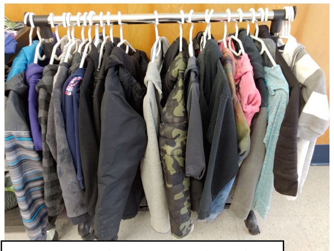
Sweaters and jackets - mostly on the smaller size