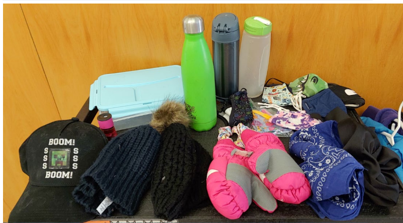
Masks, water bottles and other odds and ends