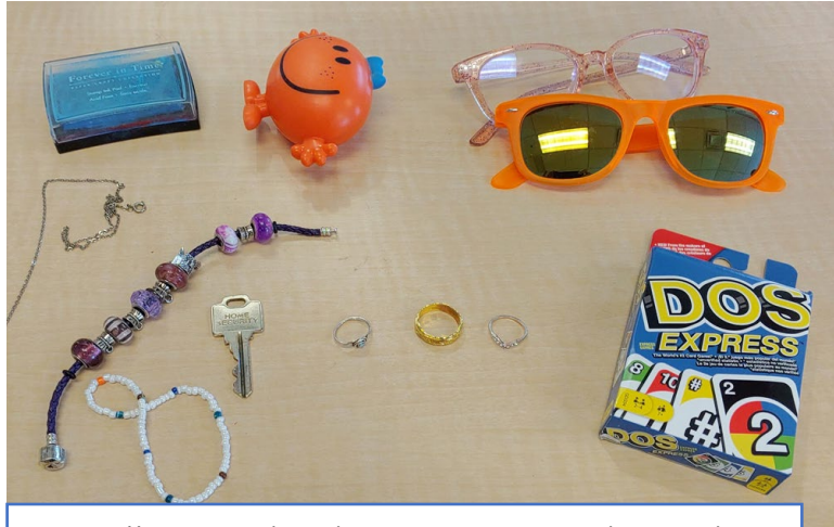
Small items that have been turned into the office.