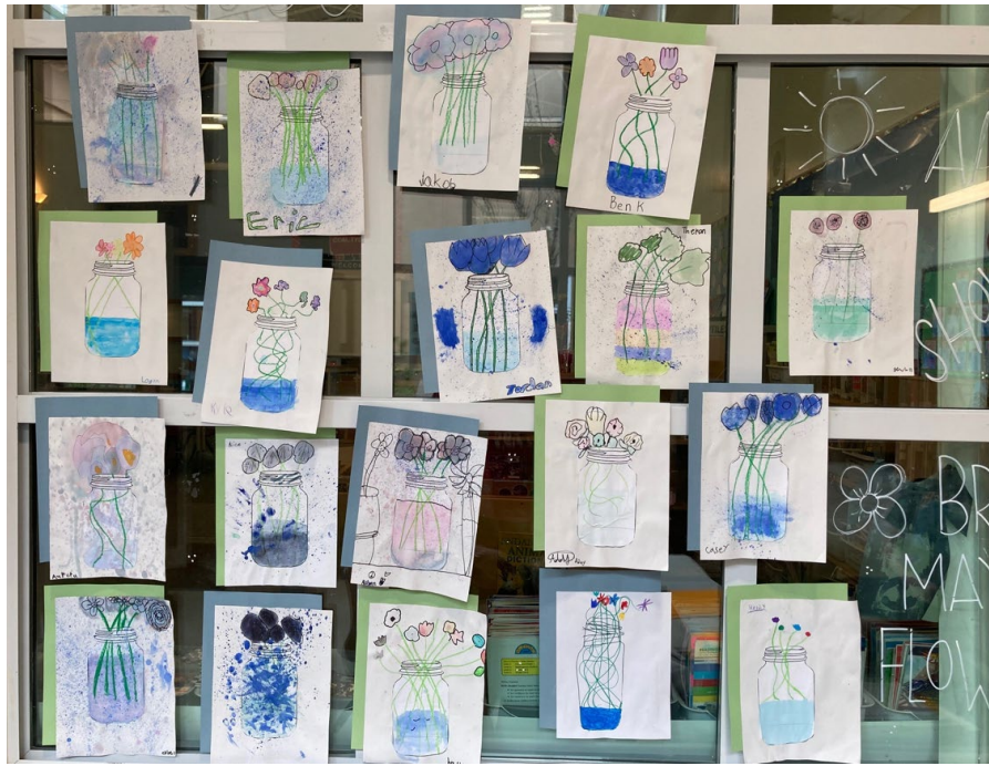
Division 13 - "April showers bring May flowers"