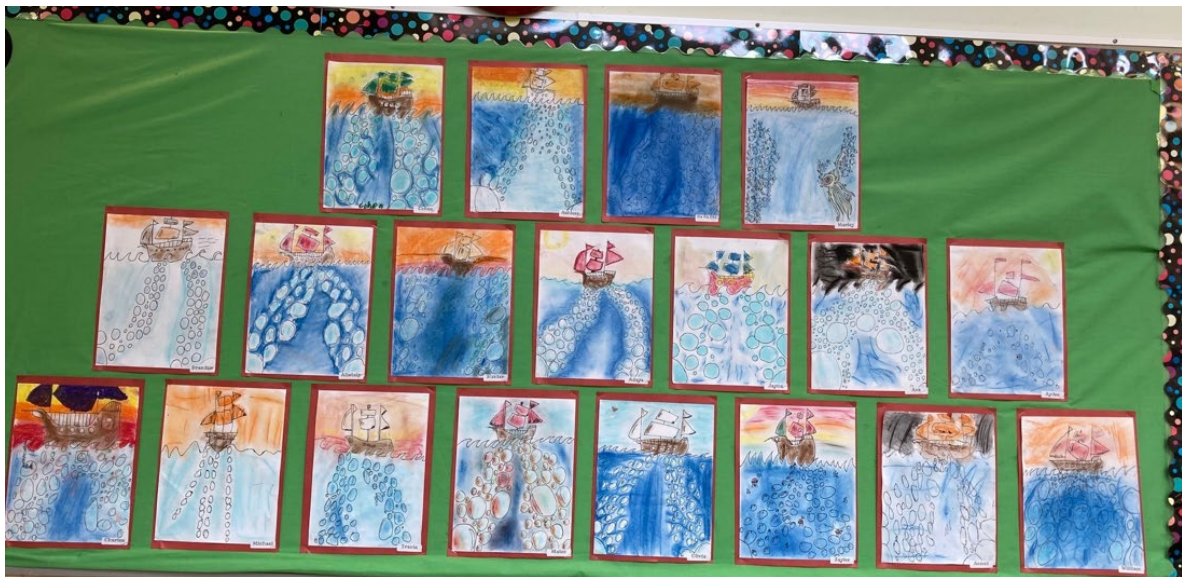
Division 12 -More water colour work!