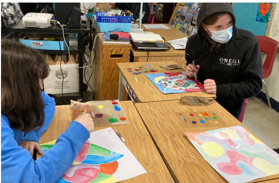
Division 15 - Wax Crayon resist with water colours