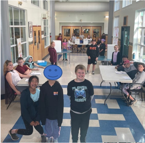
Div 12 sponsored the "Student Vote", where students in the intermediate grades were invited to come and make their choice for tomorrow's civic elections!