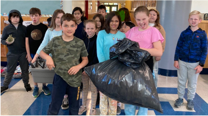
Div 11 tackled the trash on the school grounds! Yuck to the amount – yeah for their efforts!