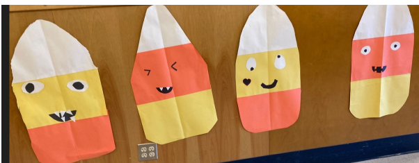
Buddy classes Div 4 and 11 created Candy Corn Creatures which are now all over the halls!