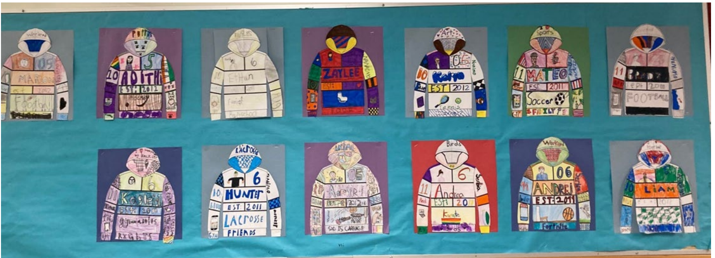
Div 13 showing off their personalities – This is us!

erase | EXPECT RESPECT & A SAFE EDUCATION