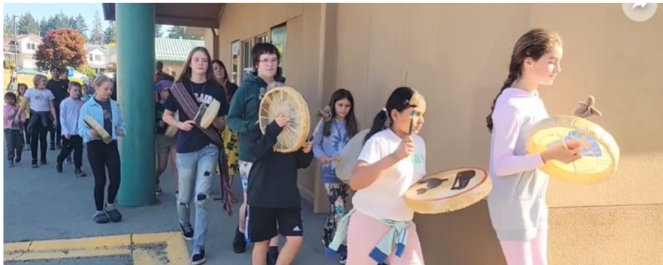
Walking around the school, thanking Mother Earth for sharing this space with us.

One of the highlights of the ceremony was the unveiling of our new logo – which is now on our NewsFlash! We can't wait to order spirit wear! At the end of the ceremony we had cake! What is a party if there isn't cake to celebrate with! Enjoy these images! Check out the news accounts for more!