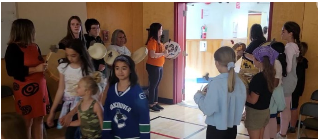
Students and staff being drummed into the gym by our drummers.