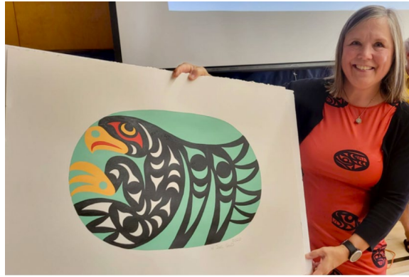
The new logo - our supernatural eagle as we are the sywéniict Spirits!