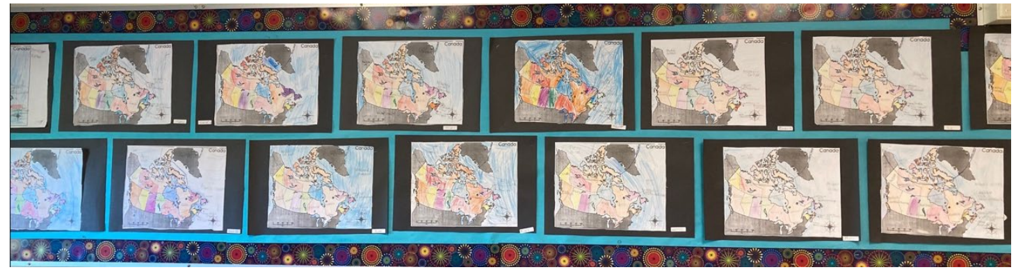
Ms. Tye is now teaching grade 4/5! Check out the maps her students completed already!