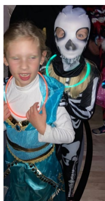
Yikes and yikes and more yikes!