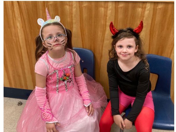
I'm tired ... can we go home yet?