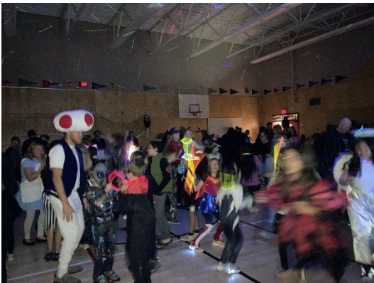
The lighting effects were magic!

Thank you to everyone who was able to join us for the first PAC-Sponsored community event since 2019! We had an amazing turnout on Wednesday night, with excellent support from parent and staff volunteers and donations from our community sponsors (City of Nanaimo, Dairy Queen – Country Club, Save on Foods – Country Club, AlSCO). We finished the night bubbling with excitement over what our next adventure could be! We have reserved Wednesdays for school use in our gym, giving us lots of options for future events. Here are some glimpses at the fun!