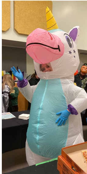
Unicorns do exist!