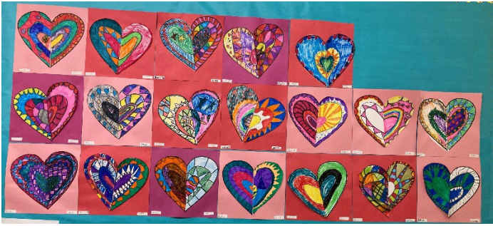
Div 11 sharing their love!

Check out some of the amazing work that is on the walls in the school!