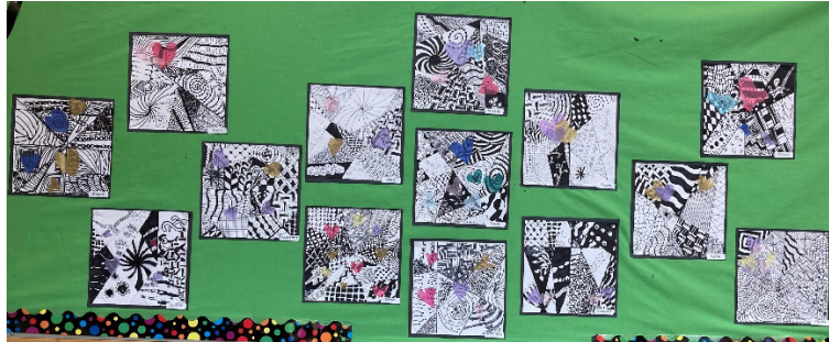
Zentangles from Division 12