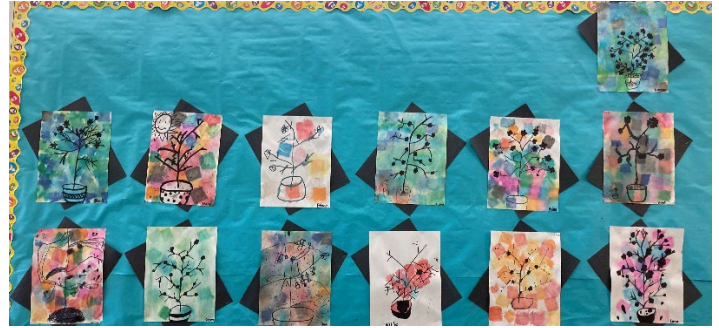
Water colour painting with Div 8