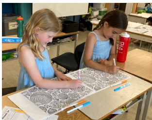
Ms. Tye offered a colouring station – out of the sun!