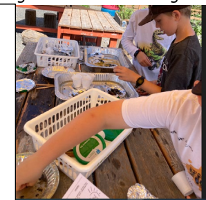
Stem challenge was captivating!